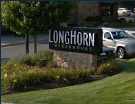
Monument sign with stone base

Building Signs. One (1) wall sign will be permitted per building façade facing a road or public right-of-way. Wall signs will be limited to individual letters (channel letters) and/or logo elements with a maximum depth of eight (8) inches. Wall signs will have a maximum surface area equal to ten percent (10%) of the façade area the sign is intended to be located on. Wall signs will not exceed eighty (80) percent of the linear width of the façade of the structure of business space on which the sign is located on. Wall signs shall not extend past the height of the building structure and can utilize internal or external illumination.