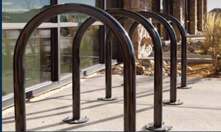
U-style bike rack

Parking Spaces, Calculations. When the calculation results in the requirement of a fractional space, any fraction up to and including one-half (1/2) will be disregarded and fractions over one-half (1/2) will require one (1) parking space. Where the required parking spaces for one lot exceed one hundred (100) cars, the requirements may be reduced by twenty (20) percent.