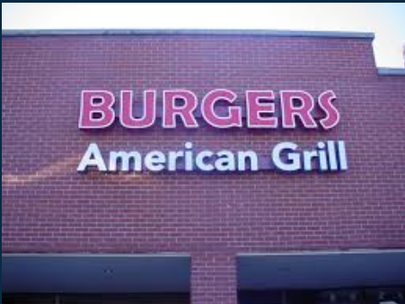
Building mounted channel letter signage