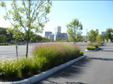
Parking lot island plantings

Front Yards. All front yards and/or yards fronting a street shall be required to provide a minimum of two (2) deciduous trees for every fifty (50) feet of street frontage.