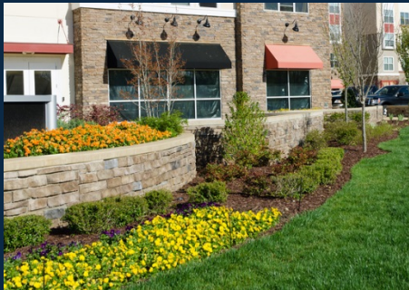
Shrubs, ground cover and flowering perennials as foundation yard treatment

Intent. The intent is to create a simple, strong landscape setting in scale with the roadways, buildings and natural areas of the development, and to provide storm water infiltration value where appropriate. This can be achieved through the use of a limited plant palate, with skillfully arranged massing of similar plant materials, especially at entrance drives, front yards and foundation yards. Plantings shall be informal at the building site perimeter and may become more formal closer to the building parking areas.