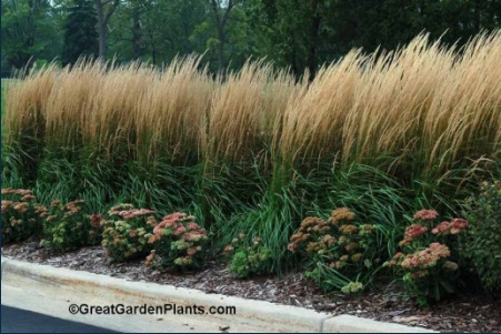
Transition plantings at edge of parking lot