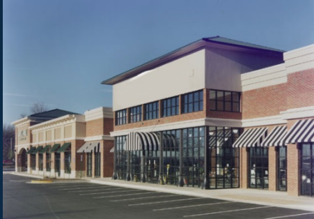
Ground Level Fenestration