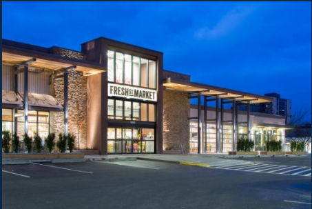
Utilization of stone and architectural metal panels as façade materials.