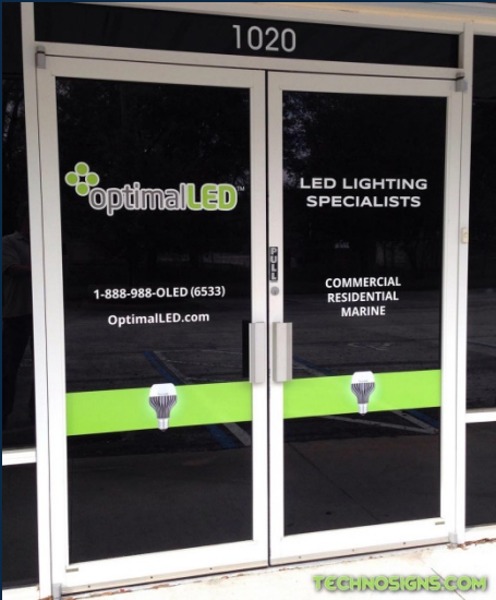
Storefront door graphics

Storefront/Door Signs. Storefront/door signs identifying the business name, logo, contact information, hours of operation, and/or similar information will be surface applied vinyl graphics. Such signs will be limited to the storefront door, including window panels immediately adjacent to the storefront door and any service/loading area doors. The signs will not exceed twenty-five percent (25%) of the door or window surface on which they are applied.