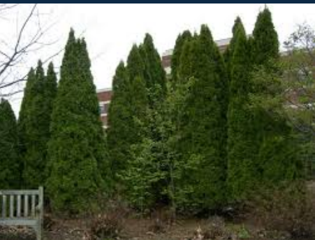
Informal massing of evergreen trees for screening service and loading areas

The intent of the transition plantings is simply to soften the view of the parking area/vehicles from the adjacent roadway, rather than create a full screen “wall”. Generally, the transition plantings should be located within five (5) to eight (8) feet from the edge of parking lot and should be edged as appropriate. The following formula shall be used to determine the total number of shrubs and ornamental grasses to be planted; Three (3) shrubs and two (2) ornamental grasses per eighteen (18) linear feet of parking lot edge that fronts a roadway. For example, ten parking stalls at 9’-0” in width = 90 LF of parking lot edge. Using the ratio of 3 shrubs and 2 ornamental grass per 18 LF of parking edge would calculate to a total planting requirement of 15 shrubs ( 90 / 18 = 5 and 5 \times 3 = 15 ) and 10 ornamental grasses ( 90 / 18 = 5 and 5 \times 2 = 10 ).