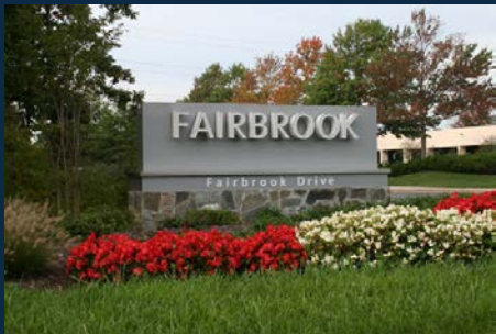
Monument sign landscape treatment