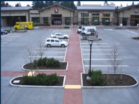
Pedestrian pathway thru parking field