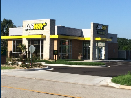
Concrete driveway apron