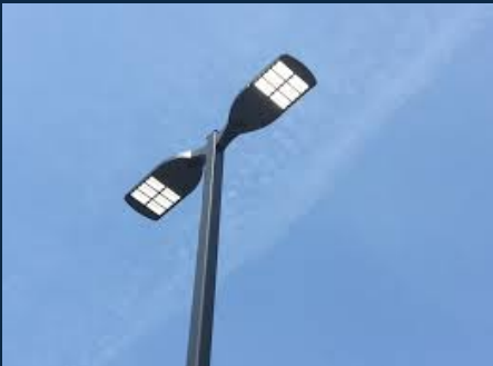
Shoe box type fixture in parking area

Ground Lighting. Only discrete ground mounted lighting of building facades, features of buildings, signage and/or landscaping will be permitted. All ground lighting shall be surface mounted to an appropriate concrete base, projecting no more than six (6) inches above grade.