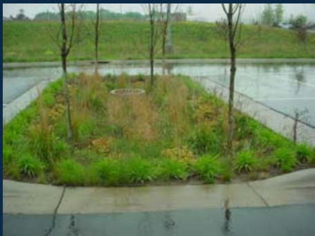
Parking island with ribbon curb for use as storm water BMP / rain garden