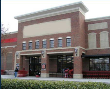
Simulation of upper level