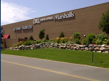
Grasses, shrubs and ornamental trees as foundation yard treatment