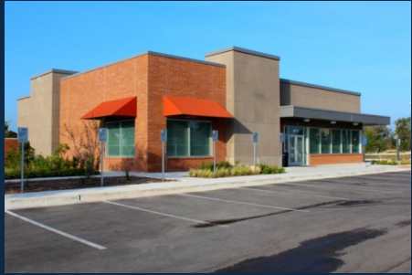
Flat Roof / Variation in Roof Line