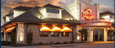
Pitched Roof / Variation in Roof Line

Ground-level Fenestration. Where large retail structures contain additional, separately owned or leased stores that occupy less than 20,000 square feet of gross floor area and have separate exterior customer entrances, the primary façade of retail structures shall be transparent above the walking grade.