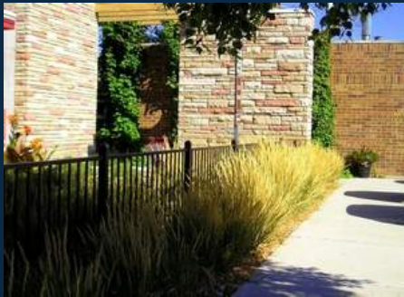
Ornamental grasses as foundation yard treatment