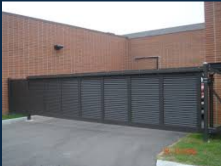
Screen wall at loading area