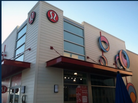
Awning & full height glazing at entry