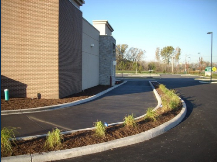
Delineation of drive thru lane / parking