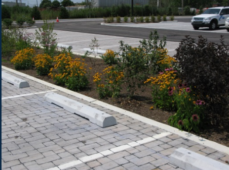
Permeable pavement system

Driveways, Entrance. No two (2) driveways/entrances will be permitted within one hundred (100) feet of one another along the same side of a roadway. No driveway/entrance will be permitted within one hundred-fifty (150) feet of a street intersection. The driveway spacing requirements of this section may be modified by the enforcement official where necessary to provide safe sight distance. No entrance driveway will exceed thirty (30) feet in width for two-way traffic. If one-way, the measurement shall not exceed twenty (20) feet in width.