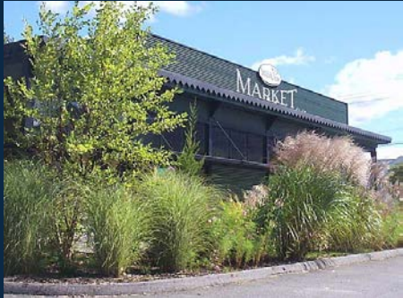
Landscape Screening of service area