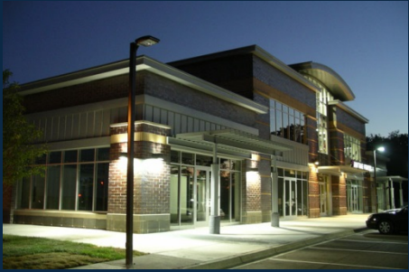
Utilization of brick, metal panels and cement board faux wood banding as façade materials

“False Upper levels” created by parapet walls which simulate an upper story shall contain windows or other significant architectural features.