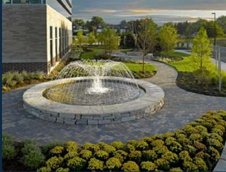
Fountain as Signature Feature

Service/Loading Facilities. Any service/loading area shall have adequate accessibility from an appropriate driveway, a maneuvering apron, and vertical clearance for truck deliveries. No portion of a vehicle using a service/loading area will project into a roadway. No service/loading area will be located in a front yard or in front of a primary façade. All service/loading areas will be appropriately screened by means of screen walls or a combination of berms and landscaping. Screen wall height shall be a minimum of six (6) feet tall and a maximum of eight (8) feet tall.