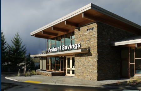
Integral planter at entry

Wall Planes. Primary and/or prominent facades shall have offsetting panels, recesses and/or break in material to break up the width of the façade. Facades greater than one hundred (100) feet in width shall have wall projections or recesses of at least five (5) feet extending thirty percent (30%) of the façade length. Facades less than one hundred (100) feet in width shall have wall projections or recesses of at least two (2) feet extending twenty percent (20%) of the façade length.