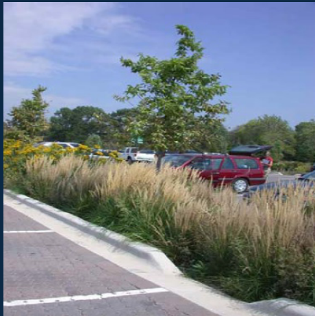
Curbing with depressed turnout for drainage

Vision Clearance. A vision clearance triangle will be maintained at every intersection of right-of-way and/or driveway. The triangle leg lengths will be twenty-five (25) feet from the back of curb at the intersection of two (2) street rights-of-way and fifteen (15) feet from the back of curb at the intersection of a private driveway and street right-of-way. No fencing, walls, structures or signs are permitted to be placed or to project into the vision clearance triangle. Landscape materials are permitted within the vision clearance triangle, but shall not exceed a mature height of three (3) feet above the street curb.