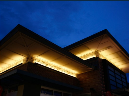
Architectural accent lighting