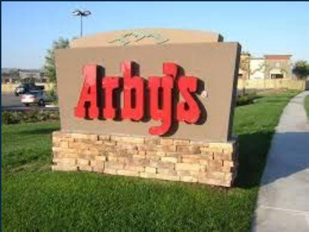
Monument sign with brick base