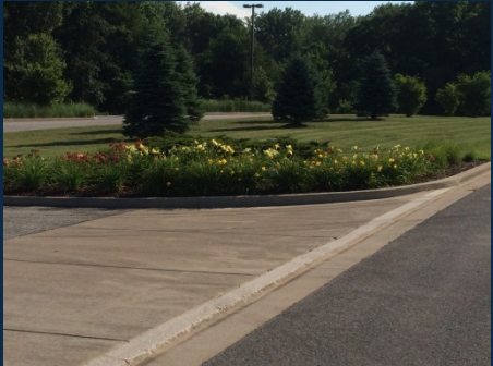
Driveway entrance plantings