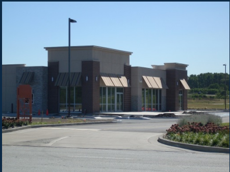
Offset / break in material along façade