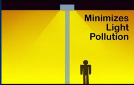
Utilize cut-off fixtures to minimize light pollution and off-site glare