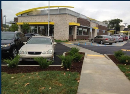
Pedestrian Walkway Connection

Screen walls shall be constructed of brick or other architectural material that is compatible with the primary structure.