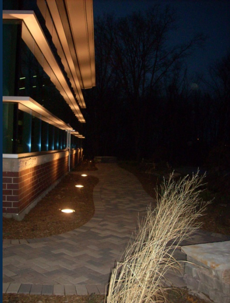
Ground mounted lighting of facade